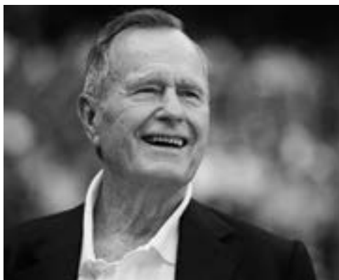
Our namesake, President George H.W. Bush

Contact DC Admissions Office: Email: bushschoolDC@tamu.edu Phone: 1-202-773-0018 Website: https://bush.tamu.edu/DC