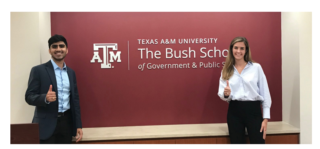
Texas A&M and Bush School College Station students visit the Bush School while interning in Washington, D.C.