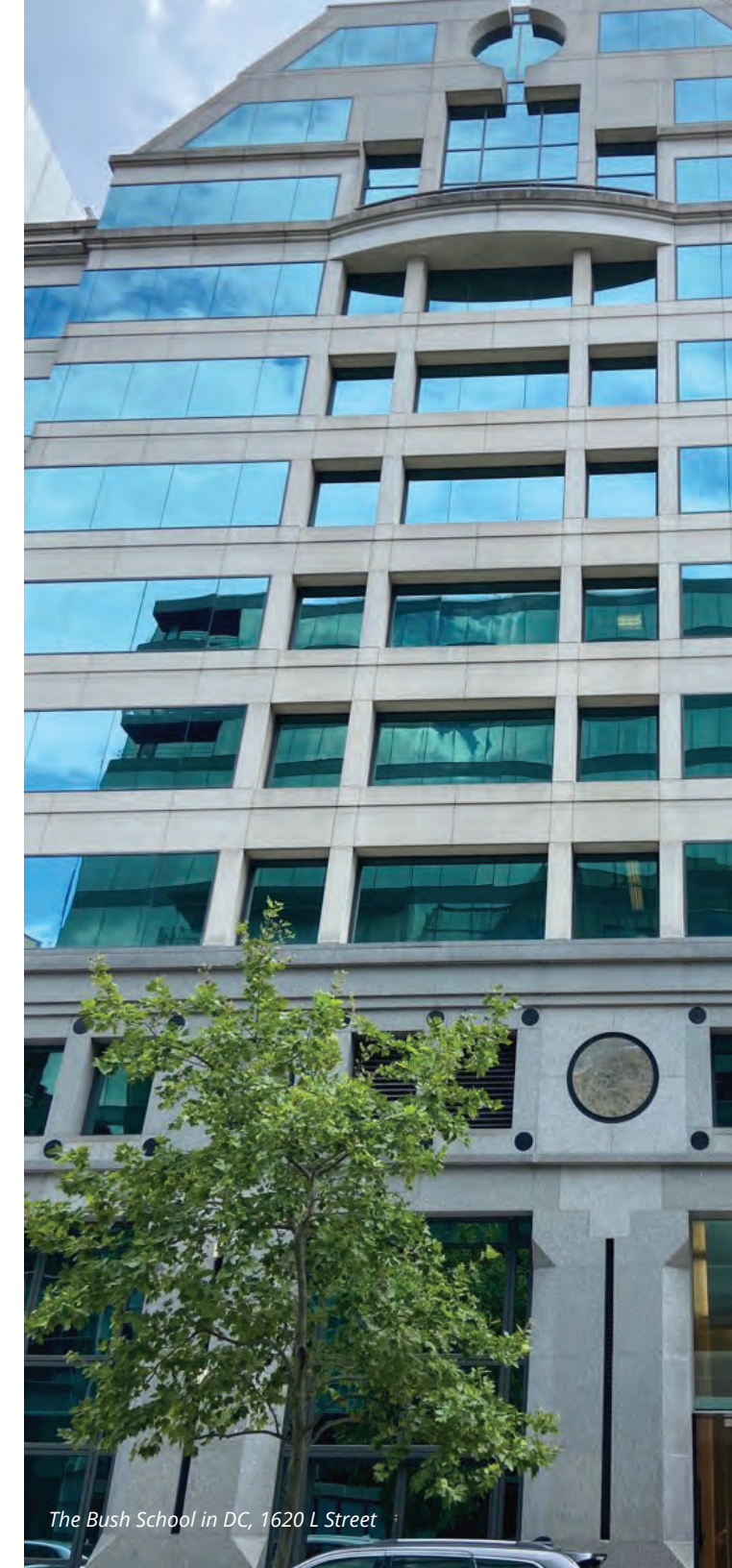
The Bush School in DC, 1620 L Street